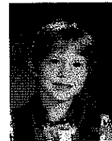
"Angel" -age progression photo